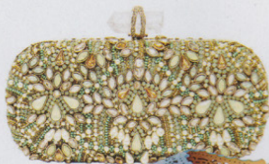
MARCHESA Lily clutch, $2,995, and Evie flat, $765.